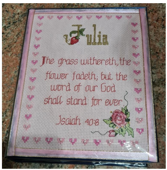
Julia's Farewell Album

If you want to create a personalised design for birthday, wedding or farewell album for your loved one or friends, doing embroidery cross stitch is also very interesting and heart warming. You may purchase a 50 pockets to 200 pockets of plain album. The album that I had purchased was a 200 pockets of album measuring 9inches X 7.2inches X 2inches (23cm X 18.5cm X 4.8cm). Cut the cross stitch cloth to 9inches X 7.1inches (23cm X 18cm).